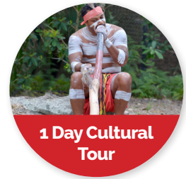
1 Day Cultural Tour